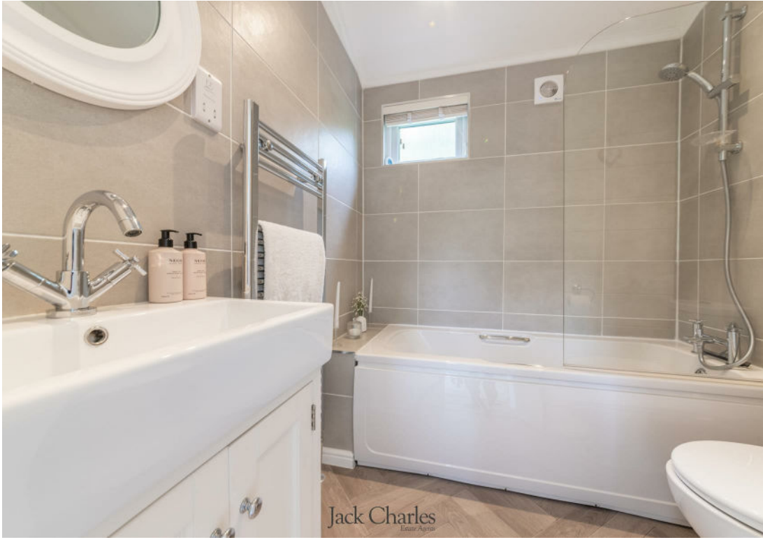
Jack Charles Estate Agents