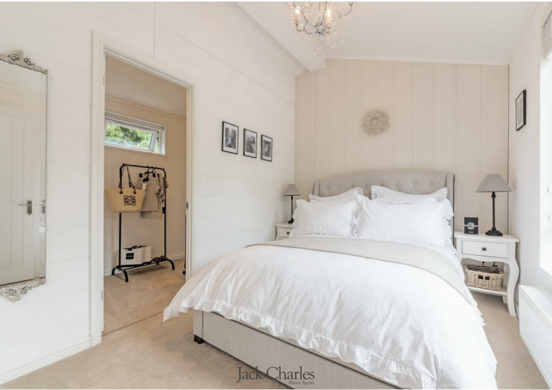
Jack Charles Estate Agents