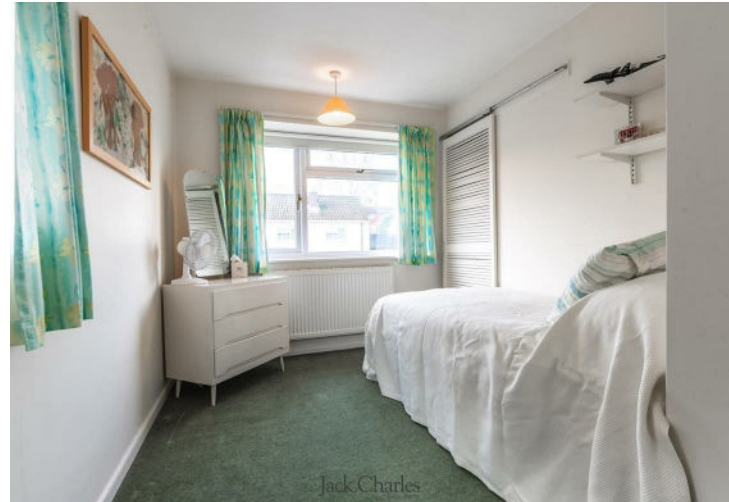
Jack Charles Estate Agents