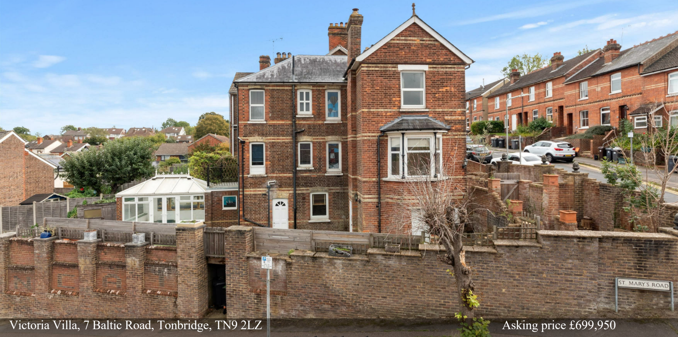
Victoria Villa, 7 Baltic Road, Tonbridge, TN9 2LZ