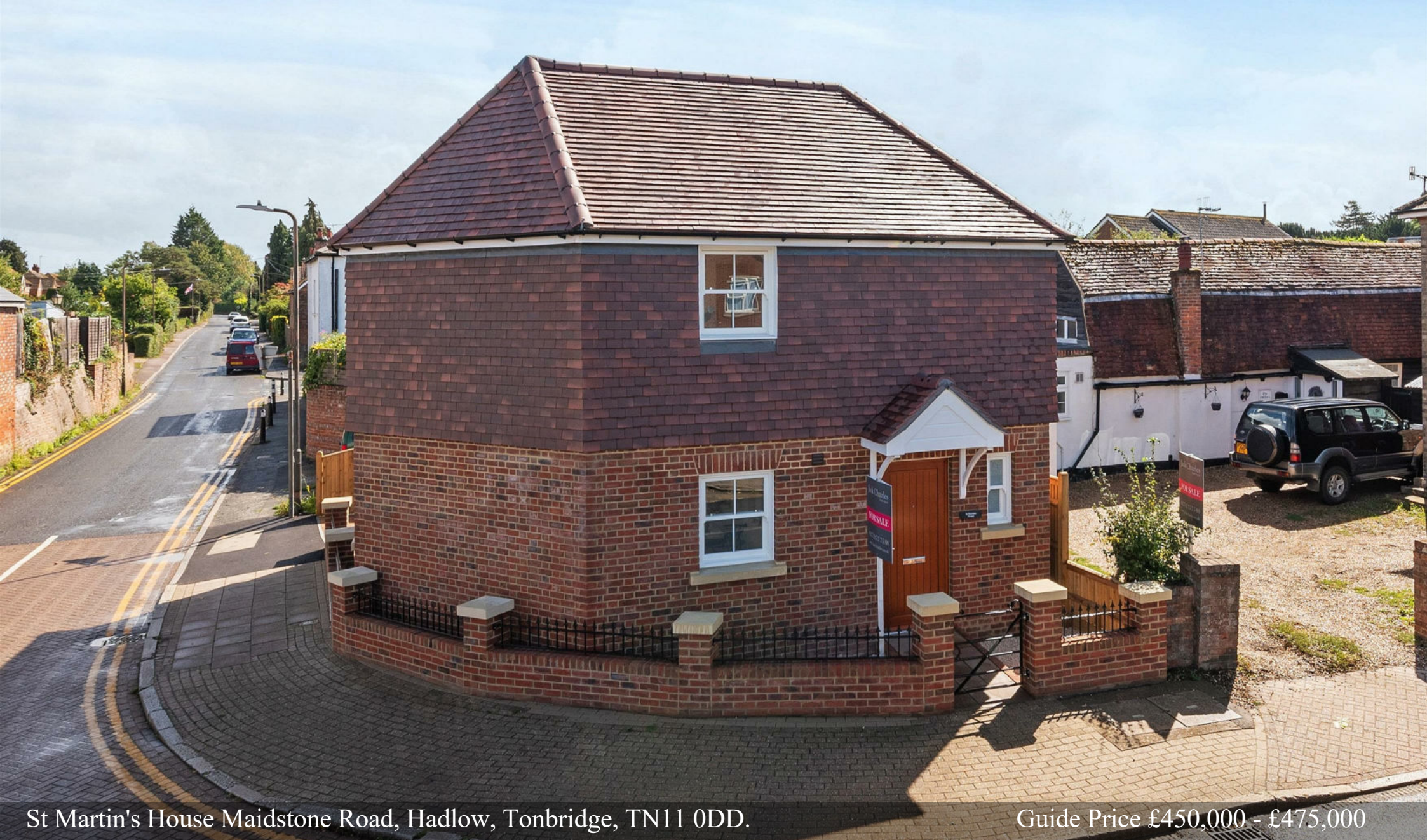
St Martin's House Maidstone Road, Hadlow, Tonbridge, TN11 0DD.