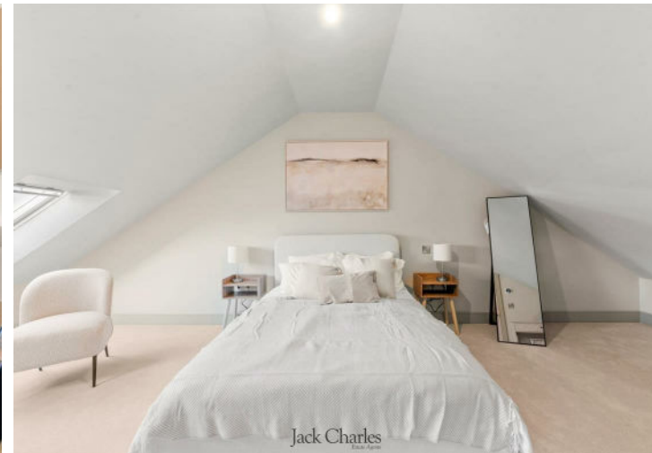
Jack Charles Estate Agents