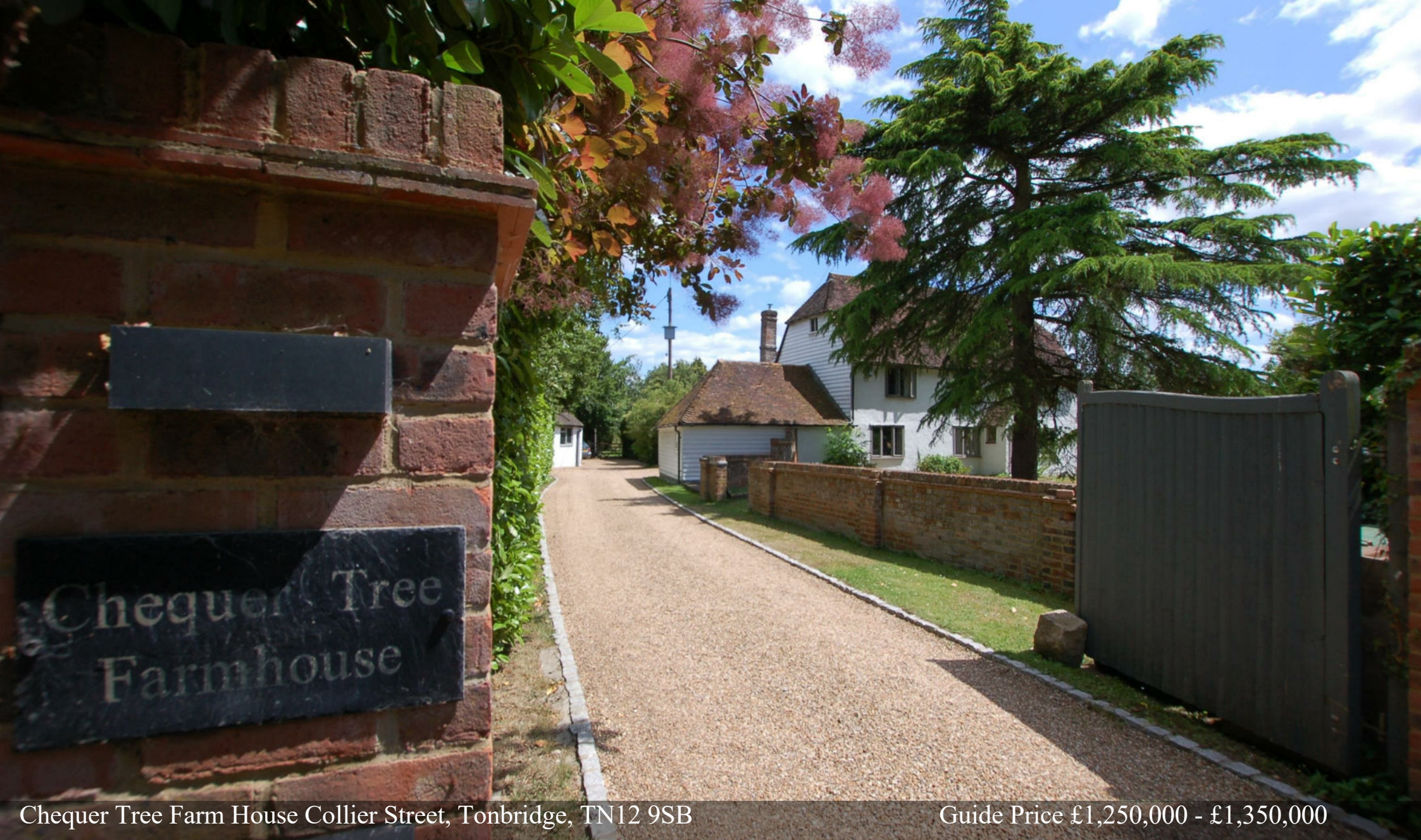
Chequer Tree Farm House Collier Street, Tonbridge, TN12 9SB