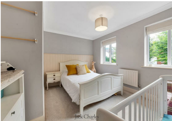
Jack Charles Estate Agents