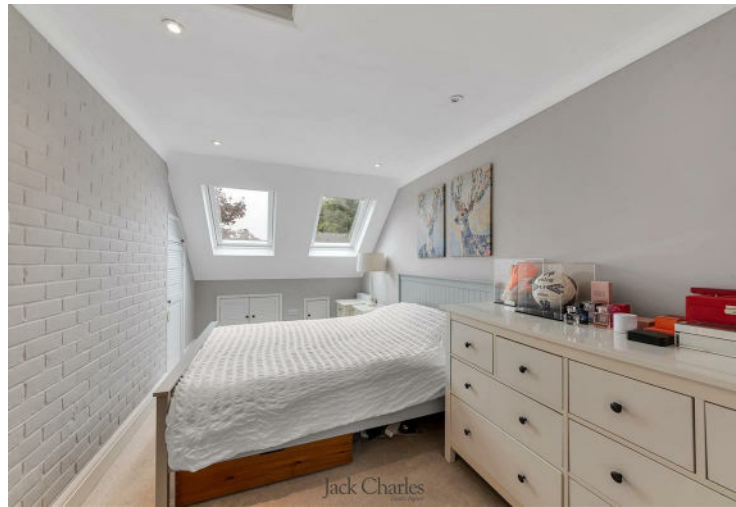
Jack Charles Estate Agents