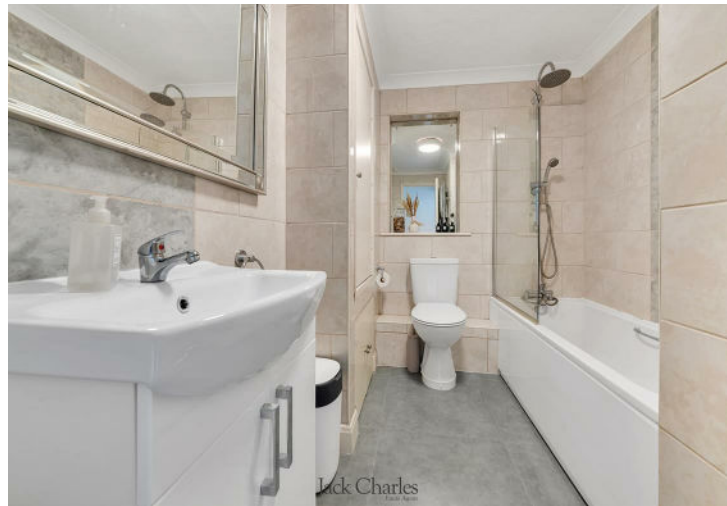
Jack Charles Estate Agents