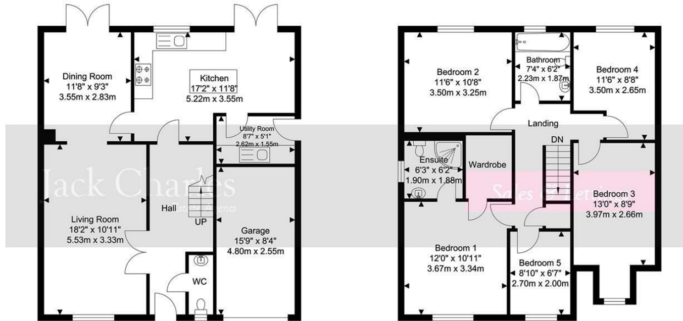
Ground Floor Approximate Floor Area 805.35 SQ.FT. (74.82 SQ.M.)

FLOORPLAN: Dimensions are maximum unless stated – subject to copyright this plan is intended as a guide to layout only and must not be relied upon for any other purpose.