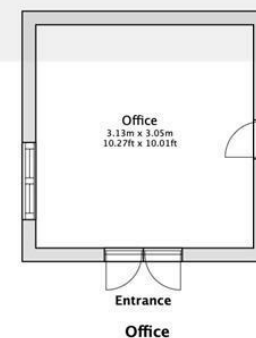
Office 3.13m x 3.05m 10.27ft x 10.01ft

Although measurements have been taken to ensure accuracy, they are approximate on this floor plan and is for illustrative purposes only