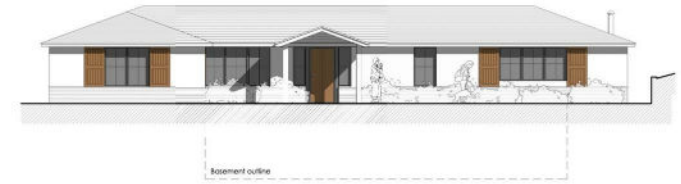
Proposed front Elevation 1:100