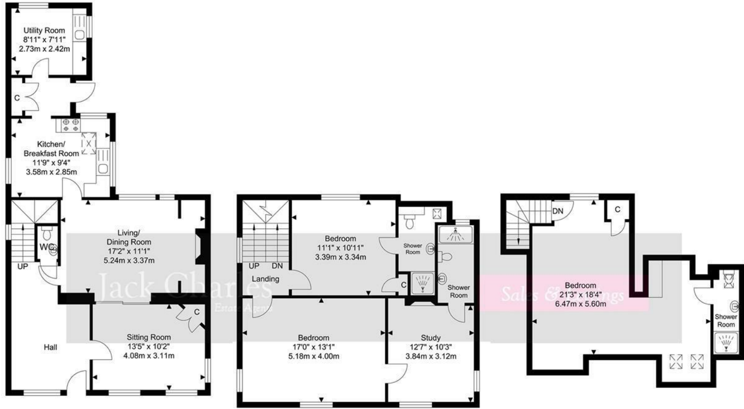
Ground Floor Approximate Floor Area 742.60 SQ.FT. (68.99 SQ.M.)