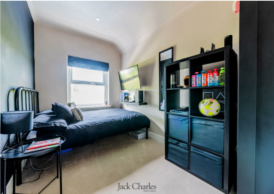
Jack Charles Estate Agents