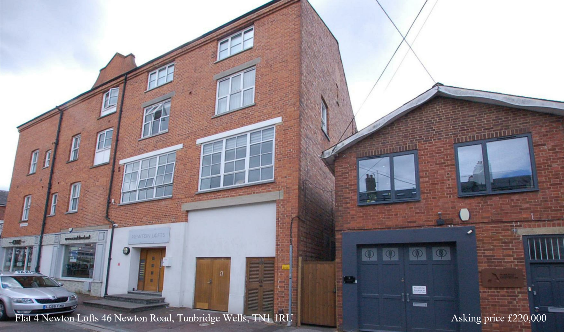
Flat 4 Newton Lofts 46 Newton Road, Tunbridge Wells, TN1 1RU